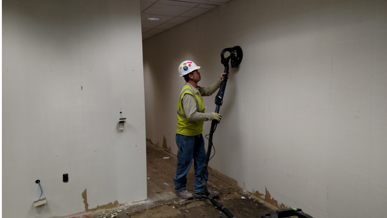
Prepping Office Walls for Level 5 Finish