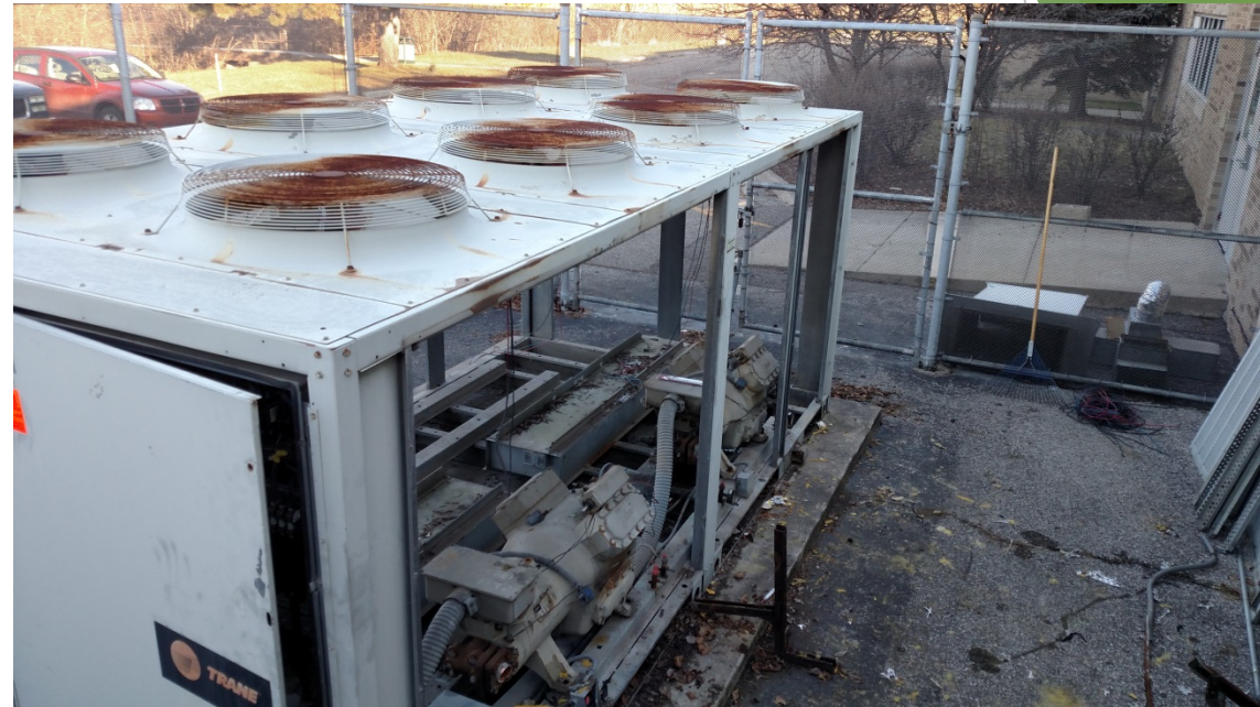
Chillers being Demoed