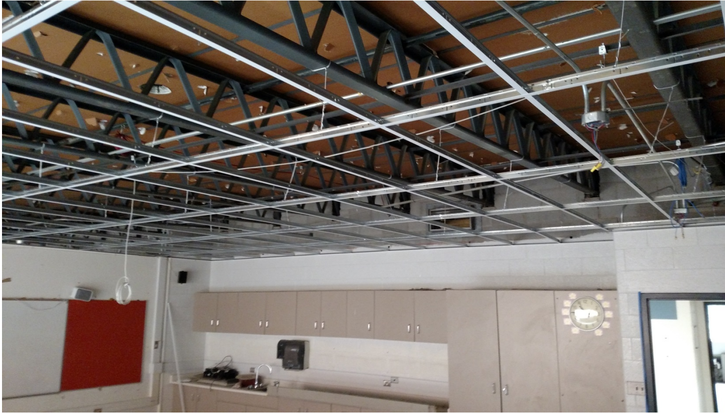
Acoustical ceiling installation