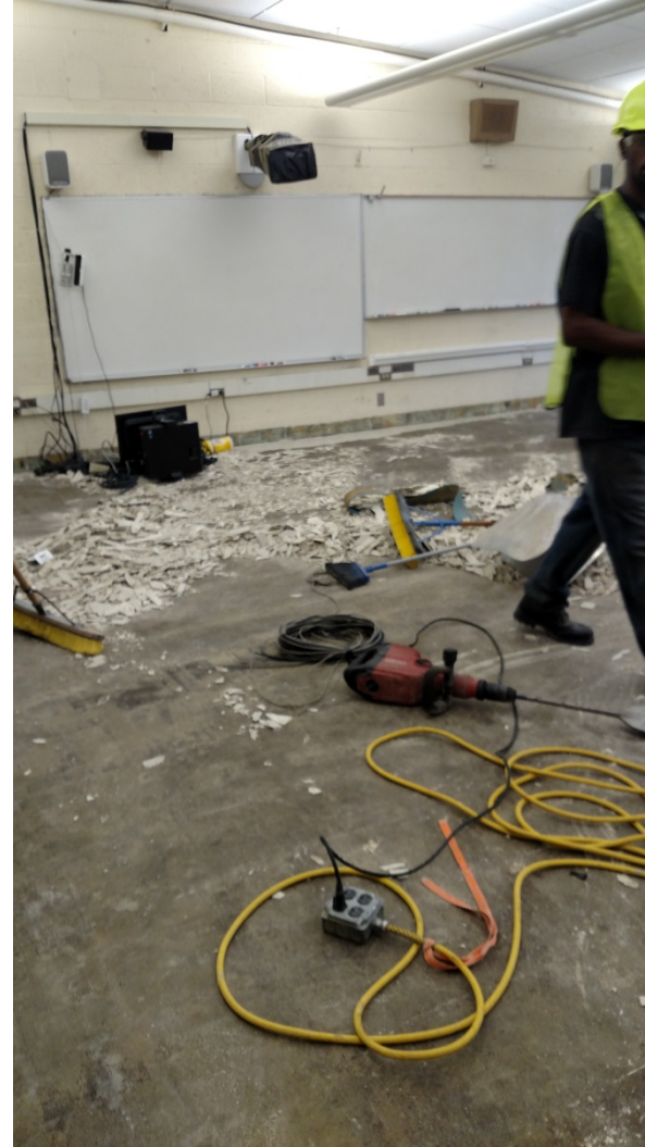
Tile Flooring being removed